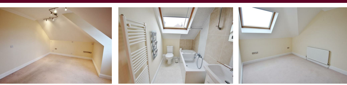
Belvoir are proud to offer to the market a newly refurbished, modern 2 bedroom apartment in the popular area of Charminster.