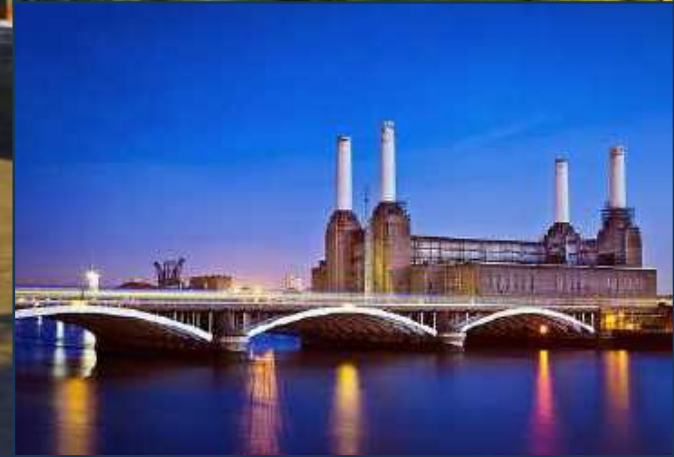
FARADAY HOUSE, BATTERSEA POWER STATION, £799,950