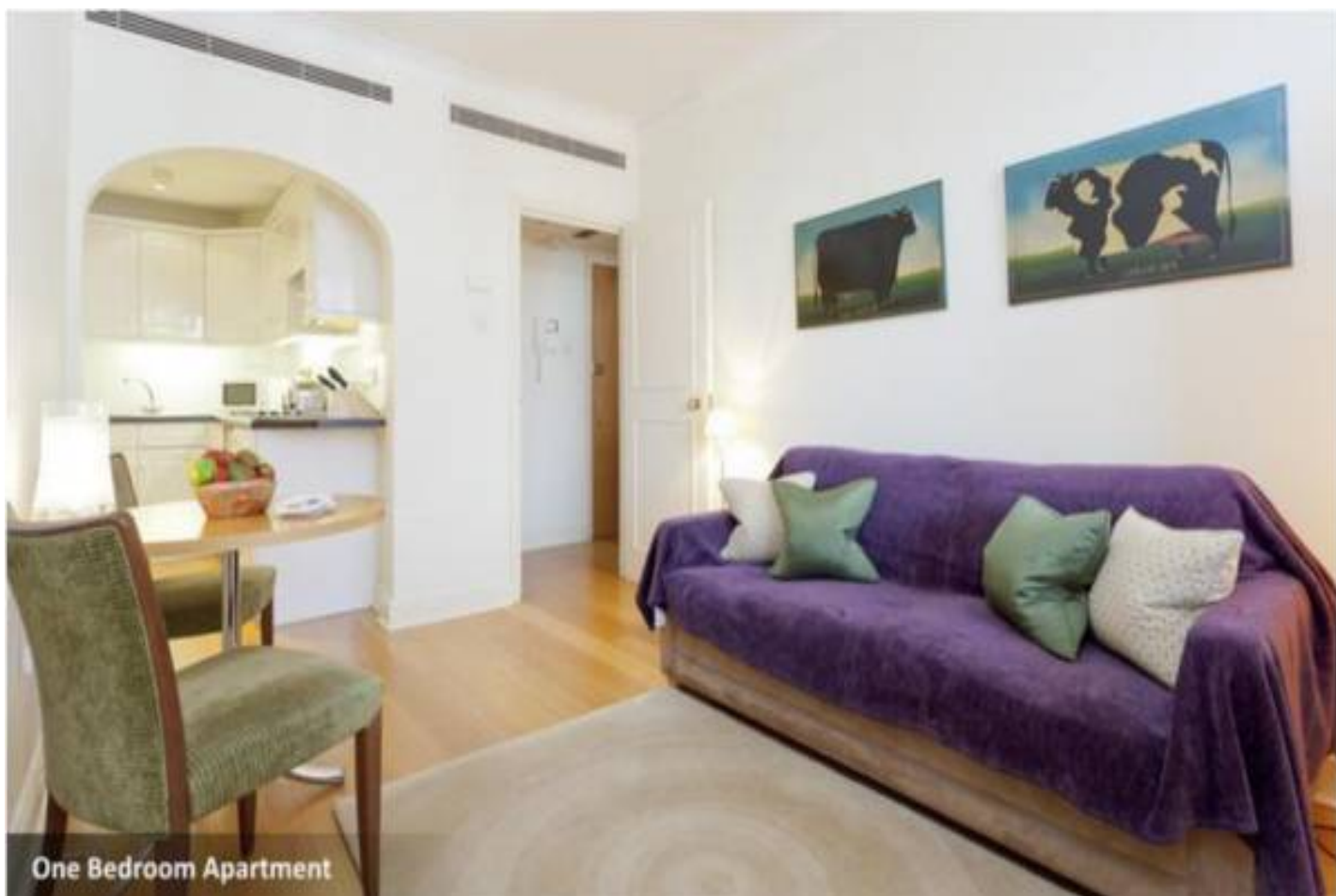
One Bedroom Apartment